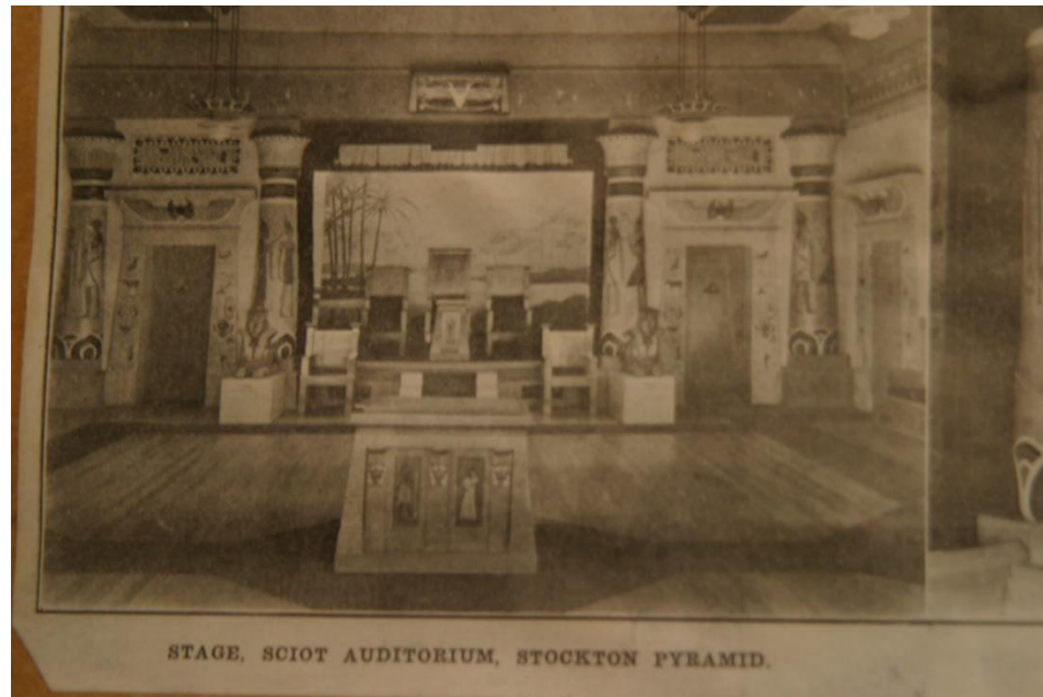
STAGE, SCIOTO AUDITORIUM, STOCKTON PYRAMID.