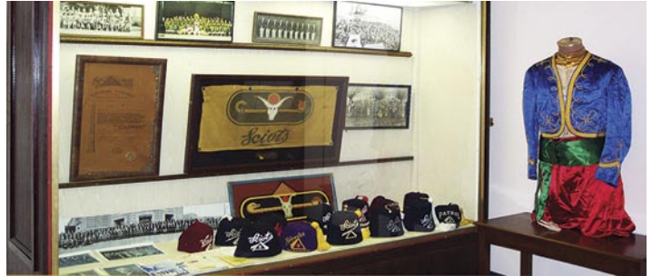
The Memorial welcomed an impressive exhibit from the Ancient Egyptian Order of Sciots to celebrate their Month in May.

The Appendant Body Month Program continues to draw visitors, visibility and excellent exhibits to the Memorial. This year, the Order of the Amaranth, the Order of the Eastern Star, the Ancient Egyptian Order of Sciots and the International Order of Job's Daughters have all provided outstanding exhibits featuring the regalia, history, and activities of the organizations.