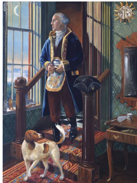
Entitled An Auspicious Occasion , George Washington prepares to lay the cornerstone of the Capitol on September 18, 1793. Shown in full Masonic regalia, he is accompanied by one of his favorite dogs, "Duchess."