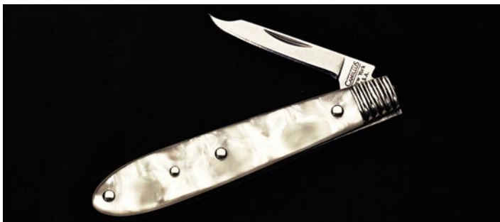
Donations of $500 or more will receive a replica of the George Washington Penknife.

(Note: Please see Membership Form on page 5 for all Membership Levels and Benefits.)