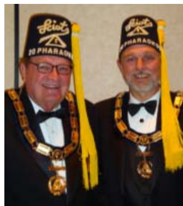
Out with the old – in the with new At the 2009 Annual Sessions